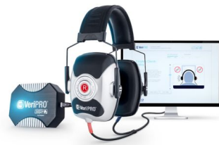
VeriPRO Fit-Testing System